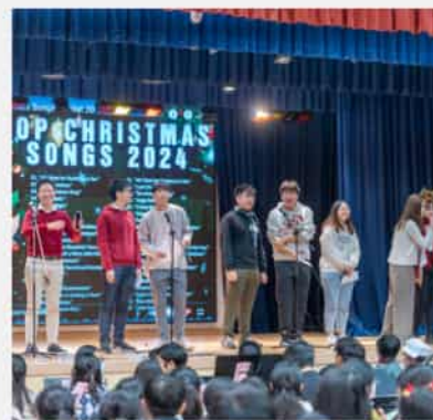
CHRISTMAS SERVICE & PARTY