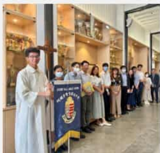
TERM OPENING SERVICE