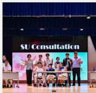
SU CONSULTATION AND ELECTION