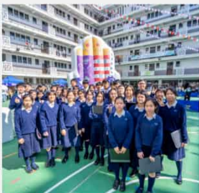
P6 INFORMATION DAY