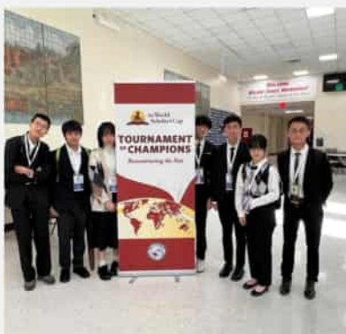
WORLD SCHOLAR'S CUP COMPETITIONS